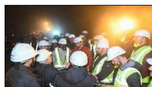
is anticipated by mid-2026. The project incorporates modern engineering features, including lay-bys at intervals of every 750 metres and three ventilation shafts to ensure operational efficiency and safety. The Lieutenant Governor was also briefed on the use of the New Austrian Tunneling Method (NATM) from both the western and eastern portals for excavation. However, officials highlighted that poor rock quality in certain stretches has posed challenges, impacting the pace of progress. Expressing satisfaction over the progress achieved so far, the Lieutenant Governor directed the concerned officials to further expedite the work to ensure timely completion and early operationalisation of the tunnel, which will be crucial for ensuring year-round con-