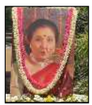
wearing a traditional Maharashtrian nath'. As the cortege moved through the streets, residents gathered along the route.

MUMBAI, APR 13: India bid an emotional farewell to legendary singer Asha Bhosle, who was cremated in Mumbai on Monday (April 13) with full state honours. The iconic voice, which shaped Indian music for over eight decades, was mourned by thousands as her final journey unfolded through the city.