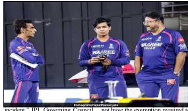
The IPL Governing Council does not have the exemption required to be using his phone while sitting there.

"We have asked the ACSU to investigate and file a report on the