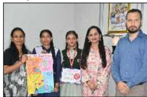
JAMMU, APRIL 13: Making and Slogan Writing Competition on Nasha Mukta Abhiyaan' at Media Complex here. Speaking on the occasion,

the Director Information congratulated the winners and applauded all participants for their exceptional creativity and commitment towards the social cause. She emphasized that such awareness campaigns play a crucial role in sensitizing society, especially the younger generation, about the harmful effects of drug addiction and the need for collective efforts to eradicate this menace. The Director further reiterated the Administration's commitment to strengthening