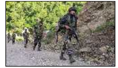
Special Operations Group of local police along with CRPF also launched a search operation at Panjirtiri, Bhini Nallah, Barota, Aglidhar and adjoining areas in Ramkote sector of Kathua around 12.15 pm, the officials said. Meanwhile, police and army are also continuing searches for the second day in SIDCO forest area of nearby Samba district, which was launched early Sunday after two suspected persons were noticed moving under the cover of darkness, the officials said.

JAMMU, APR 13: Security forces on Monday launched a search operation in several border areas of Rajbigh and Ramkote in Kathua district following information about suspicious movement of suspected terrorists, officials said. The suspicious movement of two armed persons, also carrying heavy backpacks, was reported from Soffian village towards Aamdal forest side in Rajbigh area this morning, the officials said. They said police assisted by Army and CRPF started a search and cordon operation immediately after getting the information, which was continuing when last reports were received, but there was no trace of the suspected terrorists, the officials said. In March last year, a gunfight in Soffian forest had left four policemen and two terrorists of Pakistan-based Jaish-e-Mohammad (JeM) outfit dead. The area is being used by terrorists to move towards hinterland after sneaking from across the international