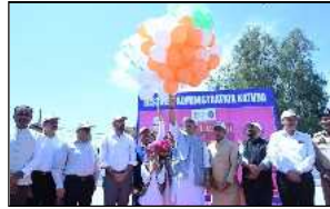
The Lieutenant Governor led a Padyatra from the Sports Stadium to Government Degree College, Kathua, joined by thousands of citizens, public representatives, senior officials, civil society members, social activists, NGOs, women, students and various stakeholders, all united under a shared resolve to make Jammu Kashmir Nasha Mukta. The Lieutenant Governor called upon every citizen, every Kathua family, to rise and unite against drug abuse. "I ignite a people's revolution to eradicate drugs from every panchnayat, every alley, every family in

destroys itself. Let us confront this challenge with unyielding resolve," the Lieutenant Governor Manoj Sinha said on Monday. The Lieutenant Governor was addressing a massive public rally at Sports Stadium Kathua, where he launched a people's movement against narcotics under the Drug Free Jammu Kashmir campaign.