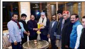
GULMARG, APR 13: A study group of the Parliamentary Standing Committee on Energy today met Chief Minister Omar Abdullah during its visit to the region. During the interaction, the Committee apprised the Chief Minister of the objectives of their visit